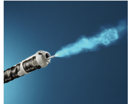
Delivery of cryogen through the Polar Wand catheter and the CO 2 evacuation tubing.

For your Polar Wand demonstration, call us at 800.451.5797.